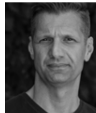
Gabór Krigler Hungary | Writer, Producer, Showrunner »Aranyélet/Easy Living«, »In Treatment«