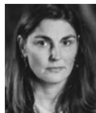
Sanne Nuyens Belgium | Showrunner, Writer »Hotel Beau Séjour«, »The Twelve«