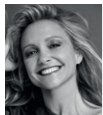
Teresa Fernández-Valdés Spain | writer, producer, showrunner »Grand Hotel«, »Velvet«, »Cable Girls«