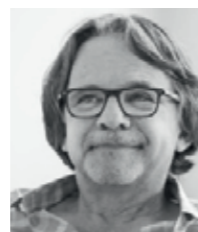
Frank Spotnitz USA/UK | writer, executive producer, showrunner »The X-Files«, »The Man in the High Castle«